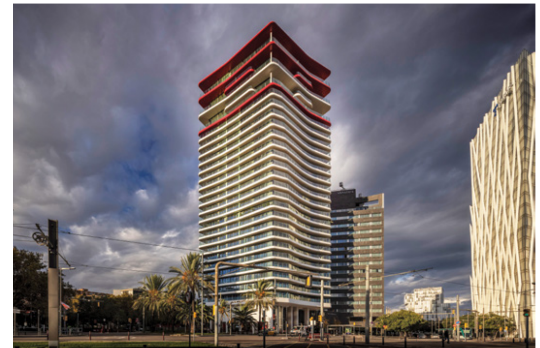
Opposite top: The curved facades and glass-walled balconies maximize views of the city, mountains, and Mediterranean. Opposite bottom: Studio Odile Decq, with HBA, designed each of the three model apartments to reflect the work of legendary Spanish artists, this one an homage to Joan Miró; photography: Pere Peris.